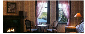
The Water Street Inn

There are four hotels within walking distance of our venues. Depending on the season and amount of people, hotel rooms can range from $69 - $200+ per night.