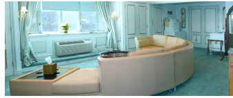
The Lowell Inn